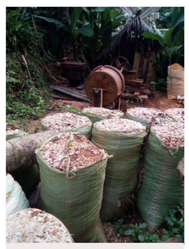
Crushed minerals, Mawamba gold mining site, Mambasa territory, Ituri

Since 2010, artisanal miners in DRC are obliged to group themselves in mining cooperatives.<sup>106</sup> Ever since, such cooperatives have mushroomed all over the eastern part of the country. Unfortunately, instead of promoting collective action among artisanal miners to further their interests, in practice, cooperatives have become vehicles to exploit the miners. Cooperatives are subject to elite capture, they establish trade monopolies, are organized along ethnic lines, and they do not provide any support to miners. This rather increases socio-economic inequality and frustrations, and could potentially increase community tensions over access to resources.<sup>107</sup> In February 2022, two people got killed following a dispute between members of two different clans in the groupement Bamuguba Sud (South Kivu province), notably the Lwito and Milambwe. The two clans competed for the management of the cooperative that oversaw the cassiterite mining site of Ndilo. Local authorities seem to have made an uncareful assessment when deciding to create a cooperative to exploit the Ndilo mine, and to assign its management to the Milambwe clan. Two members from the Lwito clan were shot when the police wanted to disperse a protest held against this decision.<sup>108</sup>