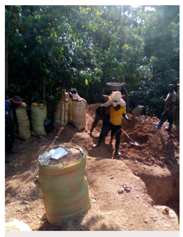
Transport and storage of gravel, Mabangala mining site, Mambasa territory, Ituri.

Although mining reform and responsible sourcing have increased the level of organization of ASM, it seems to have been particularly instrumental to local elites. Take the example of cooperatives (see