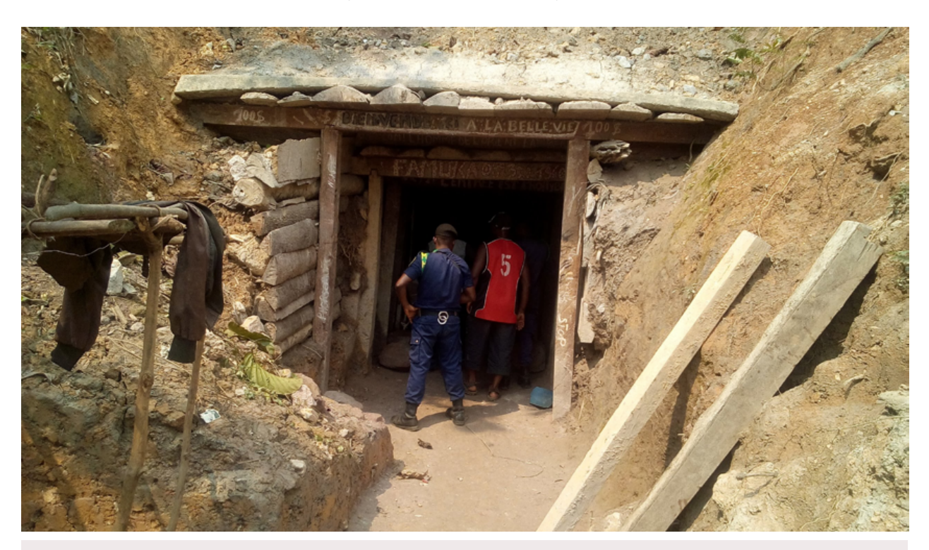
Presence of Mining Police in Kampene area, Maniema province

The state of siege "normalizes" the presence of FARDC in gold mines, as they are supposed to protect mines and artisanal miners against attacks and pillages by armed groups: this situation offers economic opportunities to Congolese army officers. The security situation did not improve during the state of siege. The civil society of North Kivu recently pointed out that during that period about 2,000 civilians have been killed, and that the armed group M23 has re-emerged.<sup>76</sup>