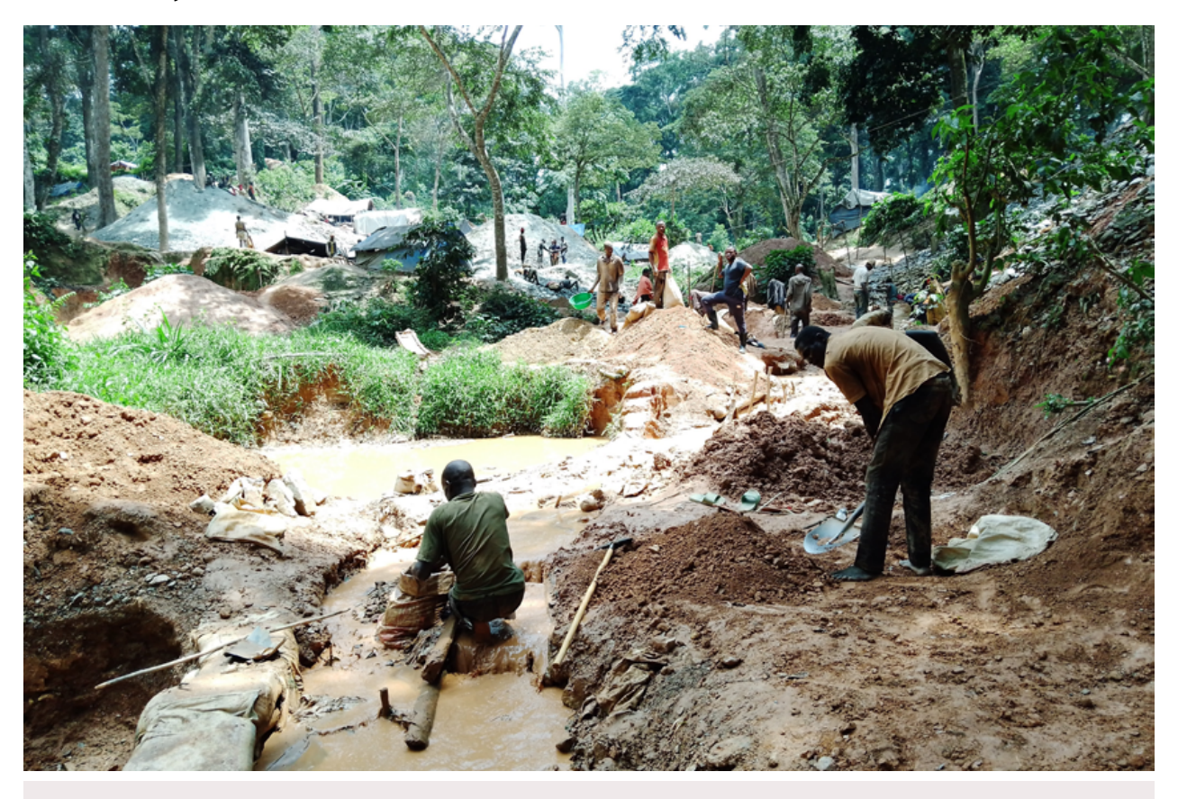
Mulunguyi gold mine, Nyunzu territory, Tanganyika

Landownership, customary land rights, and access to land in general, are important drivers of conflict in eastern DRC. According to Vlassenroot (2004) "local-level disputes over land, rather than armed struggle for control over mining sites, have tended to dominate local socio-economic competition, pitching entire communities against each other". 79 Access to land often plays an important role in mining disputes. Demarcation of mining concessions and mining sites, or compensation to the landowner of a mining site, are for example important sources of local conflict (e.g. between mining cooperatives, between cooperatives or artisanal miners and industrial concession holders, between miners and farmers). Mining is intrinsically linked to land .