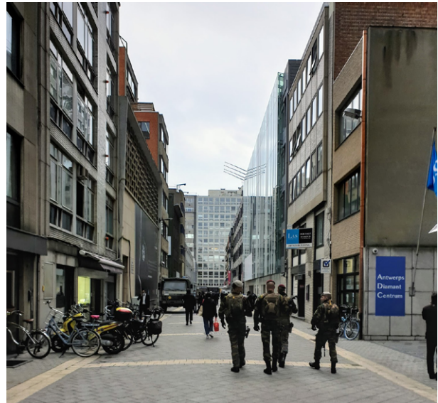
Soldiers patrolling in the Antwerp diamond quarter

Two weeks later, a new executive order was served to further cut the ties with the Russian diamond sector by banning the import of what it termed “non-industrial diamonds”. 28 Yet, further guidance by OFAC made clear that also this time the practical impact was limited. The sanctions only concerned diamonds “produced, manufactured, extracted, or processed in the Russian Federation, excluding any Russian Federation origin good that has been incorporated or substantially transformed into a foreign-made product.” 29 The large majority of Russian diamonds only enter the US market after they are polished in India, which in this reasoning reclassifies them as Indian products. Various industry analysts confirmed that it remains perfectly legal for US companies to import Russian diamonds that have been cut or polished elsewhere. 30