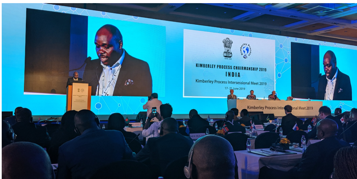
From left to right: 2019 representatives of the Kimberley Process Civil Society Coalition, World Diamond Council, Russian KP Vice-Chair and Indian KP Chair

A second major shortcoming is that decision-making in the KP is based on consensus, implying that no votes are cast and decisions are only taken if none of the 56 Participants (55 countries + the EU as single entity) expresses disagreement. Even if Russia would in this case not be allowed to participate in decision-making, KP membership includes various countries that are unlikely to support KP scrutiny of Russian diamonds, such as China, the United Arab Emirates and India. The March 2 nd UN General Assembly (UNGA) Resolution demanding an end to Russia's aggression against Ukraine provides some indication of division among KP member states, as it was supported by only 33 of the KP's 59 Participants (two voted against, nineteen abstained and five were not present for the vote).