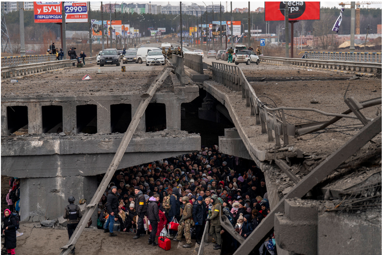
Ukrainian civilians and soldiers take shelter under a bridge in Kyiv (Photo: Mvs.gov.ua (CC BY 4.0), 2022)

With the ruble plunging, access to foreign currency becomes increasingly vital for Russia to sustain its war effort. Reportedly in fear of sanctions targeting US-dollar assets (see below), Alrosa has been testing payments in euros, yuan and other currencies since 2018. 16 The company is said to have been testing non-US-dollar payments in recent years, that is before the Russian invasion of Ukraine. Various reports 17 indicate that this practice continues to date with Alrosa auctions and sales to Indian polishers among others via banks in Germany, Italy and the United Arab Emirates (UAE).