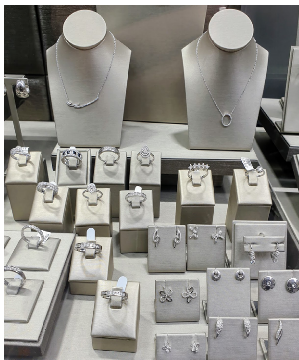
Showcase of a jewelry store in Antwerp's diamond district

The response to the Russian aggression also divides the diamond and jewelry industry. Brilliant Earth, a relatively small US jewelry retailer that has a mission to 'disrupt the diamond industry' with its ethical approach, 45 was first in taking a stance. On February 26 th it announced to have removed all Russian mined diamonds from its website. 46 Signet Jewelers Ltd. and Tiffany & Co., the two largest jewelry retailers in the US, followed a few weeks later with their decisions to move beyond the US sanctions on Russian diamonds. On March 20 th and 25 th respectively, Signet and Tiffany communicated they will no longer be purchasing diamonds mined in Russia.