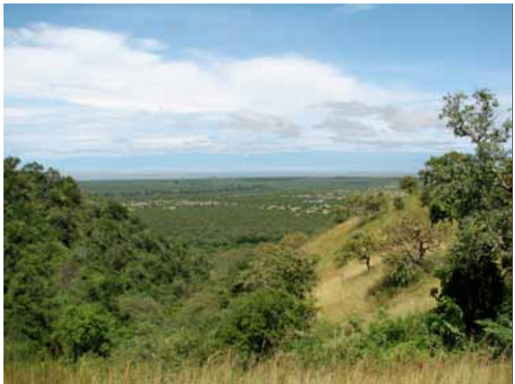
The view from Butiaba Escarpment looking west towards Lake Albert.

Moreover, there are significant exceptions to Uganda's environmental protection, for example, the permissibility of gas flaring. 44 Flaring occurs when the gas associated with oil production is burned. Flaring has primarily been criticised when oil companies do not or cannot commoditise the gas (for technical or financial justifications), and subsequently flare continuously. The practice can lead to severe health problems, environmental degradation, local toxic rain, and high levels of carbon emissions. The Guardian has reported that gas flaring in Nigeria is regarded as the biggest source of CO 2 [carbon dioxide] emissions in sub-Saharan Africa. 45