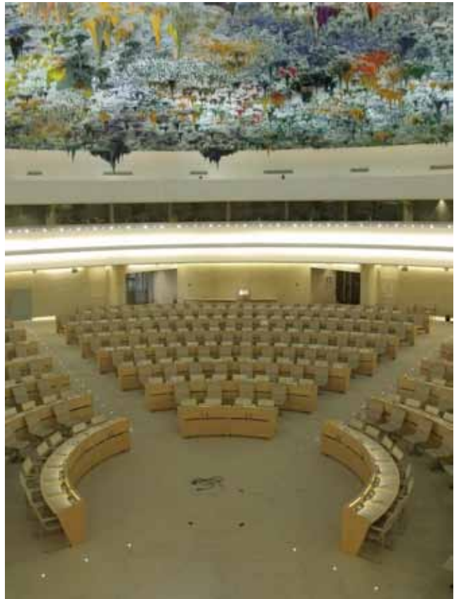
Inside the United Nations, Geneva.

UHRC fact finding involves “writing to the respondents asking them to give their side of the story; carrying out investigations which may involve field visits, calling for and examining documents related to the investigations, interviewing individuals and recording statements from witnesses.” 215 The UHRC has a mechanism for handling complaints and promotes other measures such as legal education, encouraging the State or companies to set up funds for redress, and so on. It states that anyone should be able to bring a complaint forward about a private or public company, from individuals to groups, victims, and concerned parties.