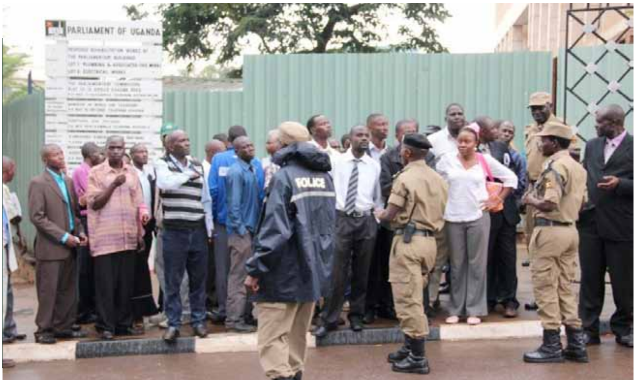
Citizens from Uganda’s oil region are prevented from entering the Parliamentary debate on oil.

Regarding the claim State often use that contracts forbid public release, the book states that, in most contracts, the wording does not stipulate that contracts cannot be made public, but merely that information attached to oil production, such as seismic data and analysis from drilling should not be disclosed. The authors of the book also highlight the unnecessary step of keeping contracts hidden as going against the grain of the emerging norm of freedom of information.