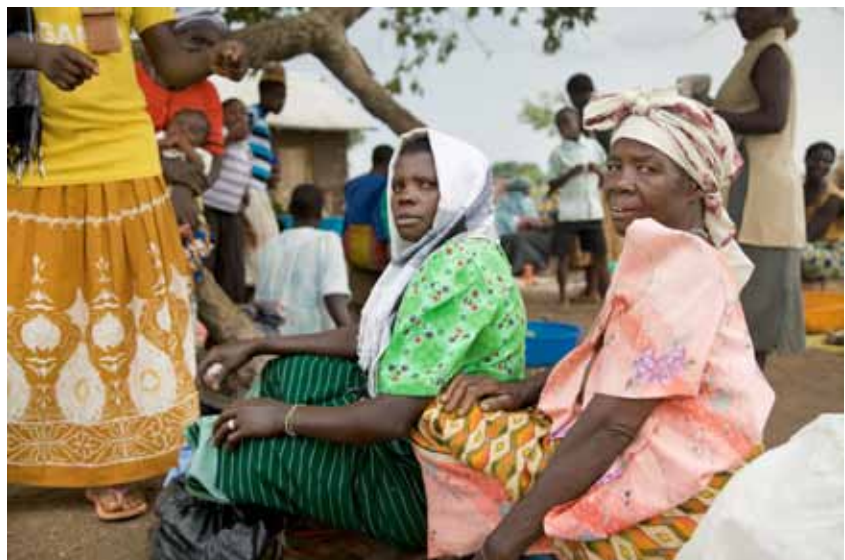
( Oil in Uganda , 2013)

have rights over land and make decisions over whether to move and if so where to. Meanwhile, costs such as disruption to societies, families and the environment are felt by women. OHCHR reports, "it has been well documented that where extractive industries operate there often is a rise in levels of prostitution, gender based violence, human trafficking, child exploitation - particularly of the girl child, and an increase in the rates of HIV/AIDS infection amongst women.... In Uganda, OHCHR has already monitored cases where women are being adversely affected by the extractive sector." 151