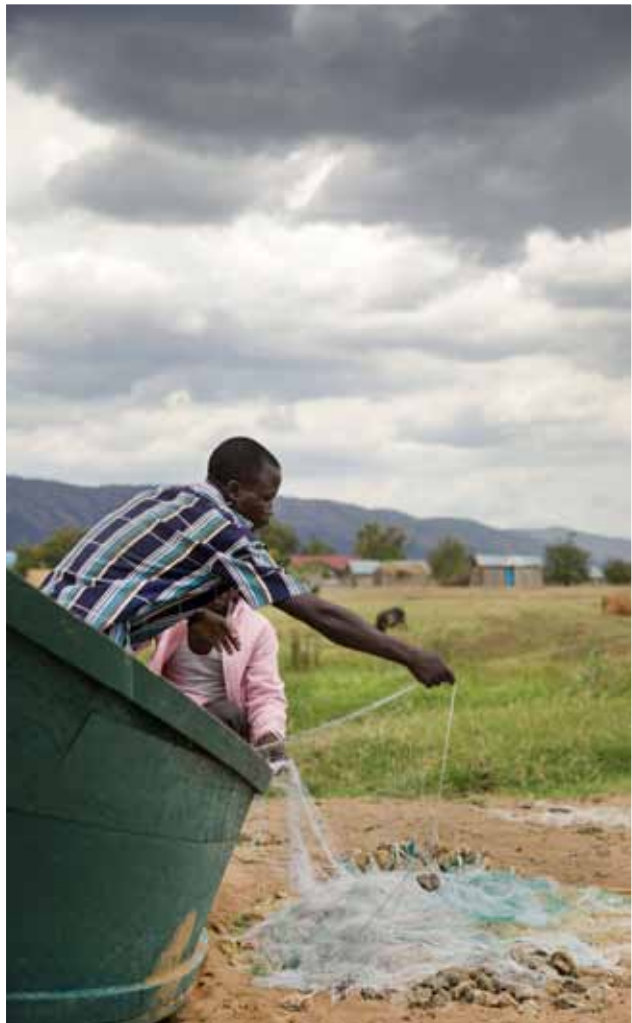
Figure 4. A Lake Albert fisherman readies his gear for a day’s catch ( Oil in Uganda , 2013)

Fishing is a form of livelihood for many Ugandans living around Lake Albert. International Alert have already found that 54% of residents around the Albertine Graben have perceived an increased restriction on fishing activities.