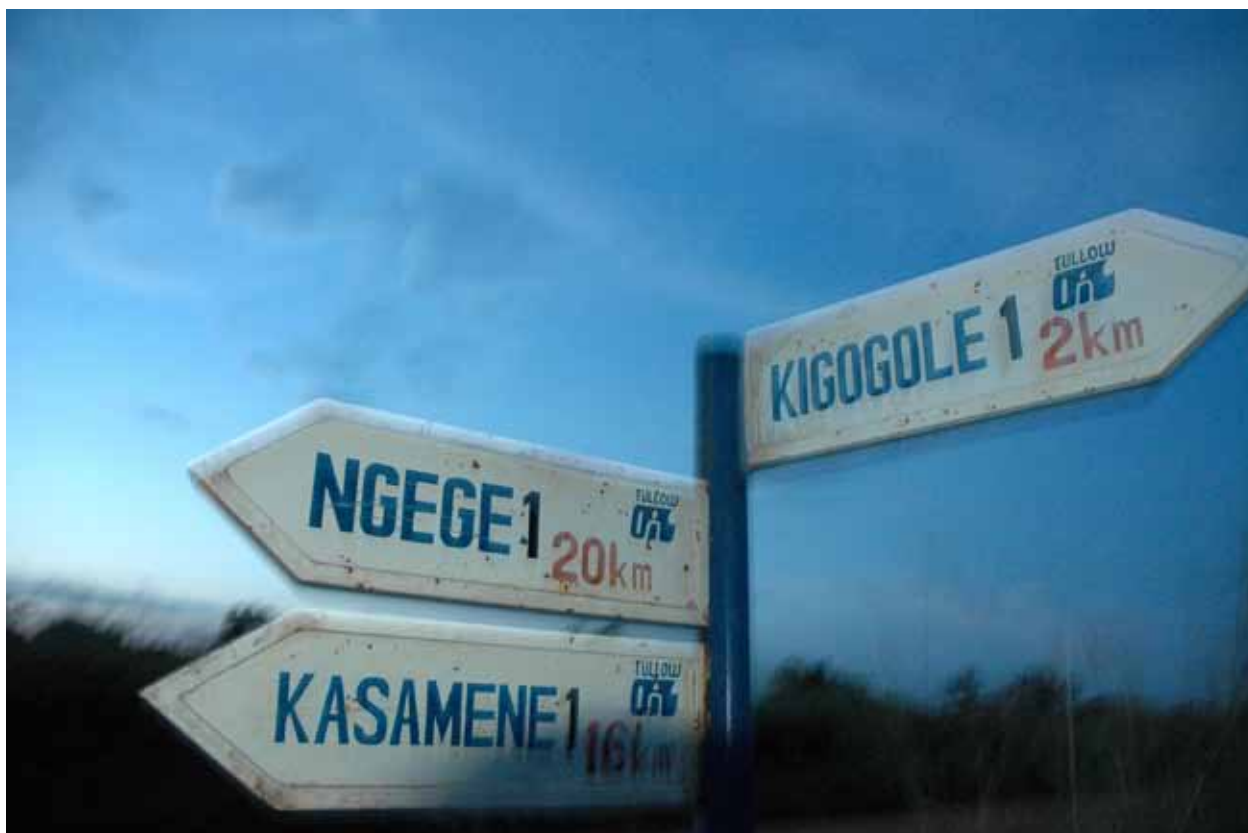
Figure 3. Directions to oil wells in Buliisa District ( Oil in Uganda, 2013 )

CNOOC has also grown to be a giant, ranking 13 in Platt's listings, with 2012 revenues of $37.85 billion 35 and profits of $11.04 billion. It is listed on both the Hong Kong and New York Stock Exchanges. 36 CNOOC engages in exploration, development, production and sale of petrochemicals and, like Total, has global properties, in offshore China and elsewhere in Asia, Iraq, Australia, Nigeria, USA, Canada and Argentina. 37