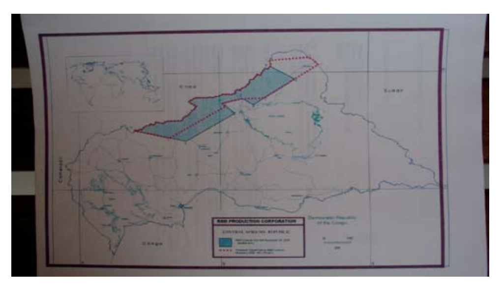
Map of oil concession (IPIS 2008)