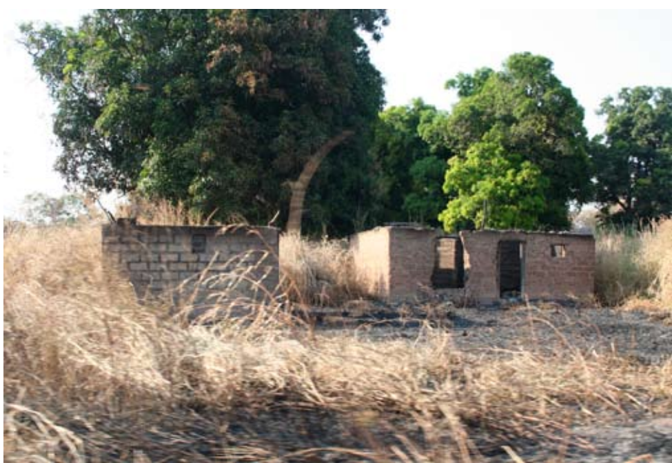
Burnt-out civilian house following retaliation operation by the FACA against the APRD (IPIS 2008)