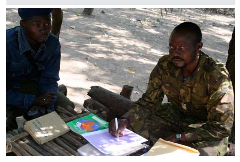
Colonel 'Laurent' of the APRD with an advisor (IPIS 2008)

The FACA are aware of the problem but believe they do not have the means to stop the traffic.