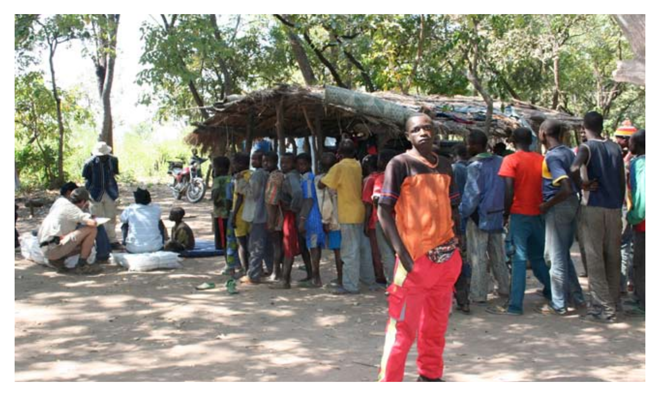
Demobilised child soldiers waiting for medical inspection by humanitarian organisation (IPIS 2008)