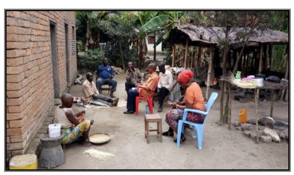
Picture Na. 5: Fact finding team taking notes from villagers during the mission in \ At Ijia \ Vllage in \ Kilombero \ 1st \ August, 2019

Research Institute (TIPRI) did not find conclusive evidence that aerial spray of herbicide by KPL