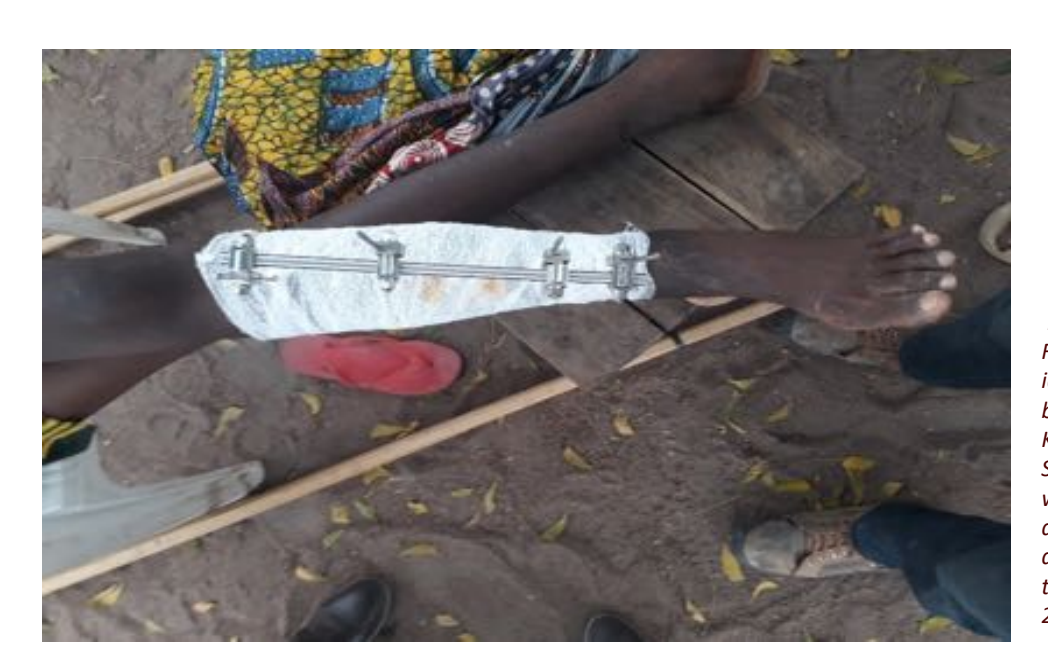
Picture Na. 7: CHRAGG Fact Finding Team identified a 15 year-old boy at Buchambi village, Kishapu DistrictShinyanga Region who was injured by the security armed guard after allegedly trespassing onto the mine area, 30th July,

The complaint was about business related conflicts between Williamson Diamond Limited (WDL), its subcontracted Security Company (Zenith Security LTD) and communities from seven (7) surrounding villages including Masagala, Ikonongo and Maganzo Centre (Luhumbo Ward) and Buchambi and Buganika (Mondo Ward), all in Kishapu Districts. The communities alleged that they were intimidated by Williamson's security contractor from conducting mining activities and using their land for farming, cattle rearing, house construction and accessing fire wood. These actions precipitated conflicts that led to insecurity and occurrence of death, injuries, sexual violence and rape. There were also complaints about compensation and resettlement by villagers of "kitongoji cha" Ikonongo in Ikombabuki village from their land grabbed by El Hilal Mining Company, operating close to WDL.