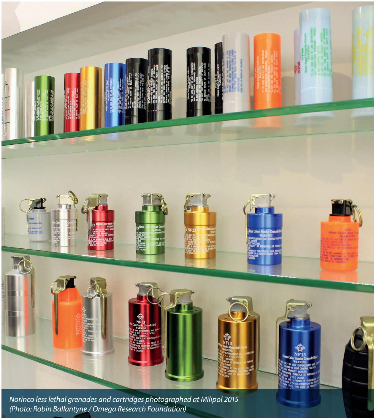
Norinco less lethal grenades and cartridges photographed at Milipol 2015