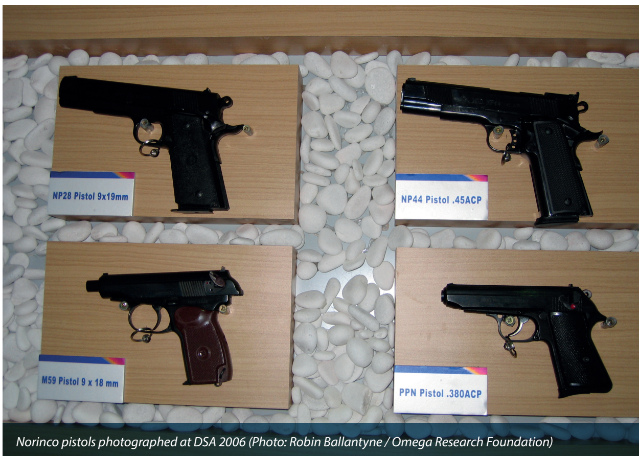
Norinco pistols photographed at DSA 2006