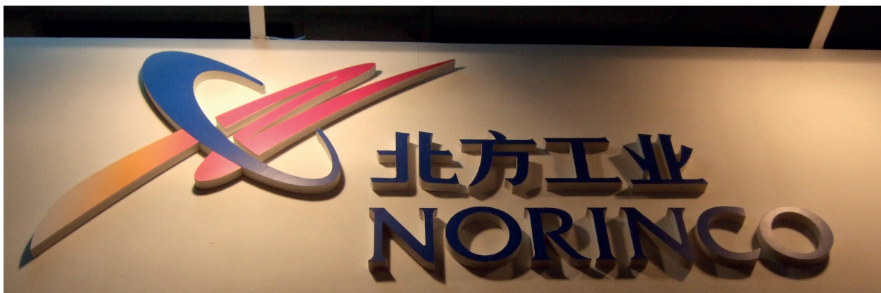
Norinco stand photographed at DSA 2008