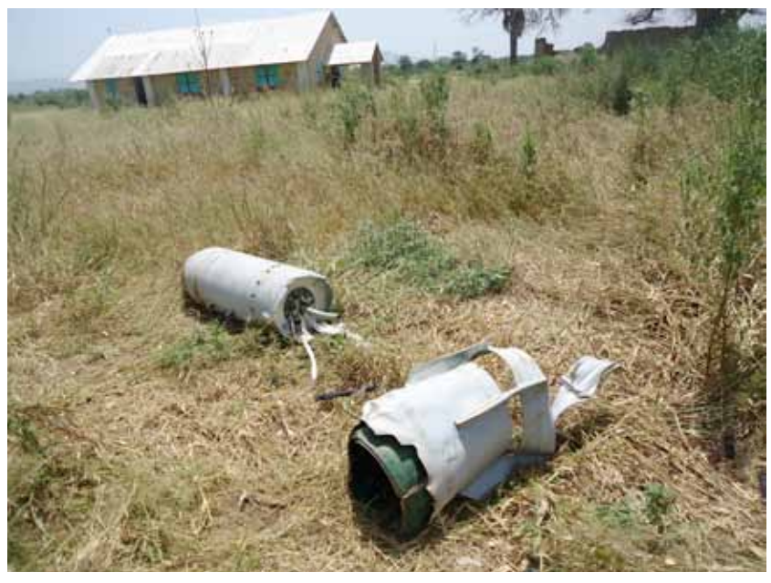
Unexploded bomb, presumably a Russian made general purpose bomb (OFAB-500) containing 126 kg of explosives, Buram locality, (Nuba Relief Rehabilitation and Development Organisation-NRRDO 2013)

The main harvest season corresponds with the beginning of the dry season, traditionally the start of new military campaigns. This period is therefore marked by a strong increase in bombardments, preventing civilians from tending to their fields. As the population has developed coping strategies such as digging foxholes and moving to areas in close proximity to caves, the direct casualties and injuries resulting from the bombardments are limited.