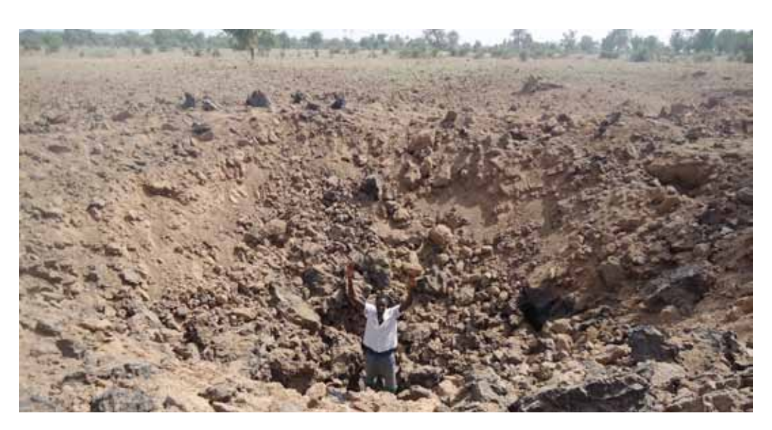
Bomb crater, Buram County, (Nuba Relief Rehabilitation and Development Organisation-NRRDO 2013)

A military strategy has been abandoned for the time being, and the issue lingers in the background as the parties await the outcome of the opinion of the independent AU experts (see chapter 1.2). Negotiators from both sides prefer to discuss win-win areas of cooperation, such as the resumption of oil production, cross-border trade, and severing ties with armed groups, rather than zero-sum games revolving around borders. However, disagreement over this highly contentious issue currently seems to be the highest risk-factor for renewed and large-scale armed conflict between the SPLA and the SAF over the medium to long term in the area.