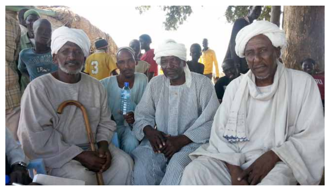
Members of the Misseriya delegation that participated in pre-migration conference, East Aweil County (IPIS 2013)

needed because, put bluntly, decades of negotiations, agreements and even the split of a country have not succeeded in pacifying this war-torn area and end the suffering of its peoples.