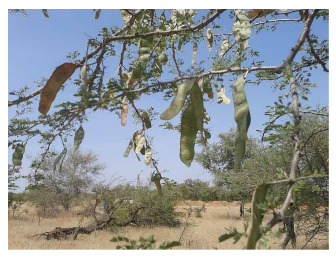
Acacia gum tree (IPIS 2013)

Ongoing conflicts in Warrap suggest deficiencies in the country's policy capacity, but also imply the impact of a long war, which seriously hampered cohesion among various communities in South Sudan. Ethnic rivalries may be rooted in distant history, but have been furthered by the decades of war.