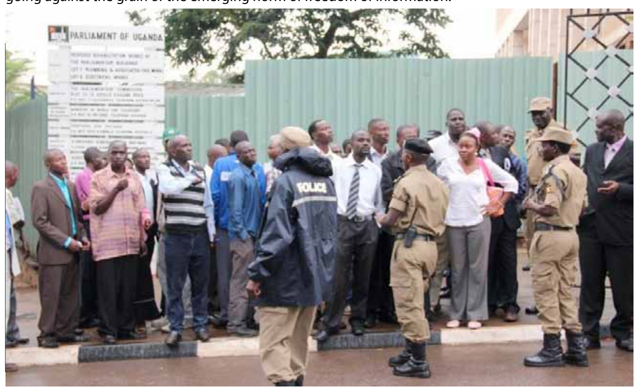
Citizens from Uganda's oil region are prevented from entering the Parliamentary debate on oil.

Regarding the claim State often use that contracts forbid public release, the book states that, in most contracts, the wording does not stipulate that contracts cannot be made public, but merely that information attached to oil production, such as seismic data and analysis from drilling should not be disclosed. The authors of the book also highlight the unnecessary step of keeping contracts hidden as going against the grain of the emerging norm of freedom of information.