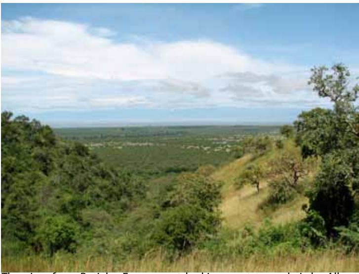
The view from Butiaba Escarpment looking west towards Lake Albert.

Secondly, some EIA's are criticised for being sub-standard and ethically compromised, as they are conducted by private practitioners on behalf of project