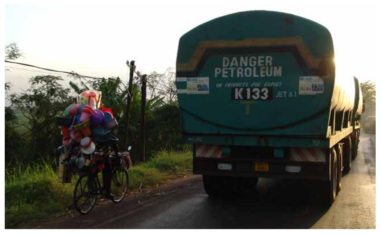
An oil truck transport's petroleum within Uganda. Within a few years, such fuel will be extracted and refined within Uganda.