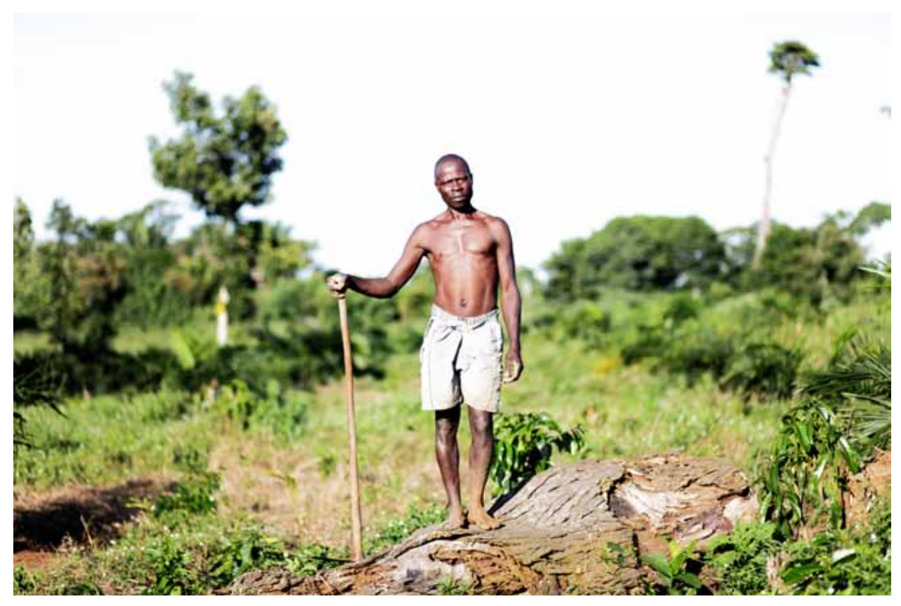
A Ugandan citizen stands on the two acres of land he has left to make a living from. From a series by Friends of the Earth on Land Grabbing in Uganda. Copyright: Friends of the Earth, 2011, Creative Commons. Under a Creative Commons Licence. (Please see: <a href="http://creativecommons.org/licenses/by-nc-nd/2.0/legalcode">http://creativecommons.org/licenses/by-nc-nd/2.0/legalcode</a>).

If the government under the reasoning of "public good" acquires land, legally, compensation must be given. According to the Ministry of Lands, Housing and Urban Development, the Ministry makes calculations about compensation owed to local communities affected by oil extraction in the Albertine Graben using figures from District Land Boards. However, this process is then handed over to the Ministry