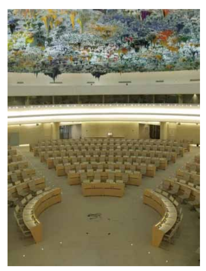
Inside the United Nations, Geneva.

"NHRI's are potentially important avenues at the national level for remedying cases of human rights allegations involving corporations. NHRI's play a major role in monitoring and reporting of human rights abuses in the business sector, facilitating legal reforms, building capacity of government institutions as well as working