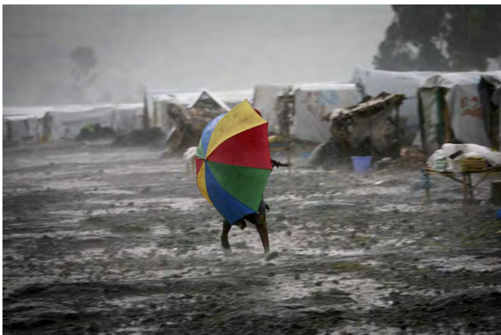
A woman caught in a rain storm in the Kibati camp north of Goma in eastern DRC, 4 November 2008. Many of those in Kibati camp had been displaced by fighting between the CNDP and the DRC armed forces

Forces, including facilitating the supply of arms, and reported complicity in the recruitment of adult and child CNDP fighters within Rwanda. 42 This continued a pattern over many years of Rwandan military support for armed groups in the eastern DRC, including supplies of arms and military support to the CNDP's predecessor group, the Rassemblement Congolais pour la Démocratie-Goma (RCD-Goma) . 43 support which only appears to have ended in 2009 with the arrest of CNDP leader Laurent Nkunda in Rwanda, the hasty integration of CNDP and other armed group fighters into the DRC armed forces (FARDC), and a subsequent violent joint operation by DRC and Rwandan forces against the FDLR armed group in which serious violations of international humanitarian and human rights law were committed by both armed groups and the DRC national army. 44