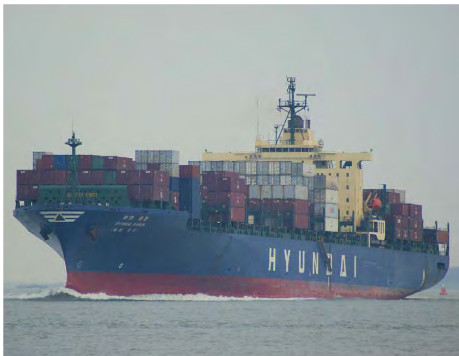
MV Hyundai Baron, which transported components of 155mm K-310 cluster munition artillery shells to Pakistan in April 2009

The UK passed legislation in October 2008 which effectively prohibits UK individuals and companies, including UK-registered companies, from doing “any act calculated to promote the supply or delivery” of a range of prohibited weapons, including cluster munitions and their components, “where that person knows or has reason to believe that such action or actions will, or may, result in the removal of those goods from one third country to another third country.” 35 Amnesty International contacted Zodiac Maritime Agencies Ltd in December 2009 expressing the organisation’s concerns that a cargo carried on one of their vessels may have consisted of components for K310 cluster munitions, noting the relevant UK legislation, and requesting further details about the cargo. 36 Nonetheless in February 2010 revenue authority documents show that a further 1.515 metric-ton consignment from Poongsan Corporation of inert components for K-310 artillery shells – again described in detail on shipping documents as 4 pallets of “OF155MM K310 TP PROJECTILE (DUMMY)” – was transported to Karachi by the MV Hyundai Emperor , another UK-flagged vessel listed on the fleet list of Zodiac Maritime Agencies. 37