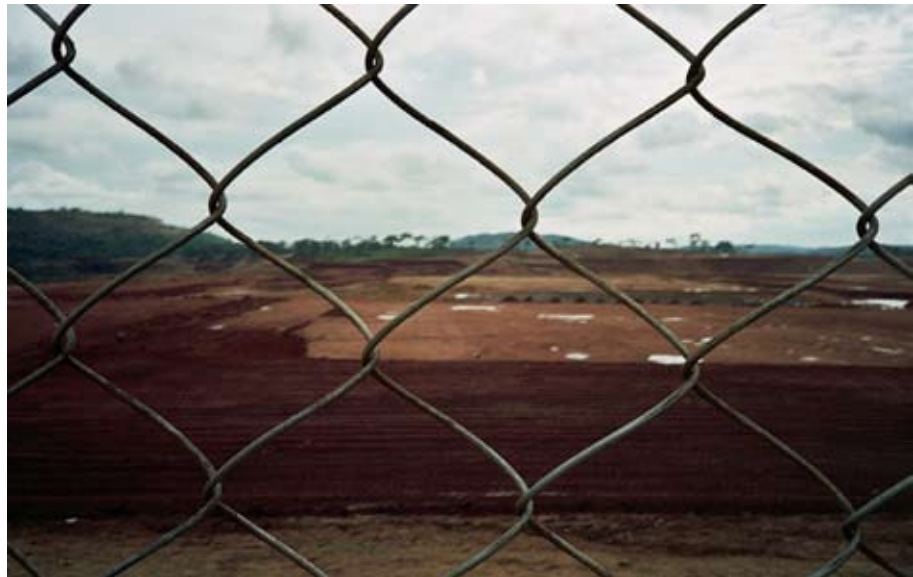
At this site, TFM plans to have its processing plant running by 2009.

On November 30, 1996, the Congolese state owned company Gécamines 13 and Lundin Holdings signed the Convention de Création 14 to create a jointly owned company called Tenke Fungurume Mining Company s.a.r.l. (TFM). 15 On the same day, the Republic of Zaire, Gécamines and Lundin Holdings also signed a Mining Convention.