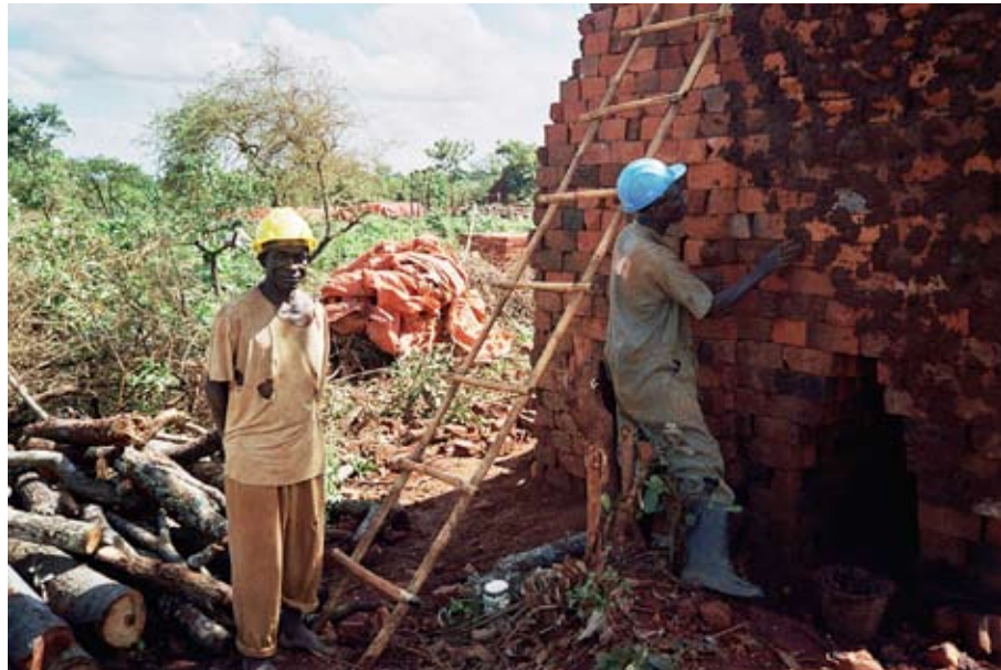
As part of TFM's social program, bricks are being made for houses at Fungurume.

During a “Question & Answer” session in May 2006 with representatives of the Kolwezi authorities a higher amount of money was mentioned for the development fund; some US $2.7 million, which was considered by the local residents to be “far from enough”. TFM representatives replied that this figure had been given to illustrate the functioning of the fund and the contributions to the fund will depend on the metal prices on the world market and the production level in a given year. 187