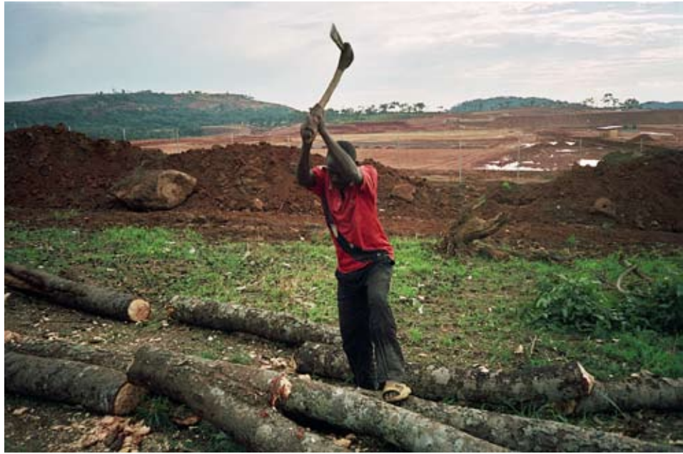
A view of the TFM plant zone, from what is left of Mulumbu village.

The Tenke Fungurume Mining project achieved an operational stage in 2006, after an almost ten-year sleep. 114 Since there has never been any exploitation, it is called a green-field mine. The copper and cobalt deposits at TFM are “one of the world’s largest known copper-cobalt resources” and will be developed into a “large-scale, long-life mine” 115 . Unit costs will remain low for a simple reason: the hills that will be exploited in the concessions have very high tenures of copper and cobalt.