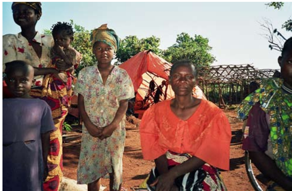
Resettled people from Mulumbu village hope that TFM will keep its promise to build them houses.

On the Route Nationale a signpost reads Ferme Munongo . The village chief at Munongo agreed for the new village to be built but, as mentioned by the locals in Mulumbu, none of the new houses have been constructed. It is possible to see dozens of plots of land as well as the very first bricks for the foundations of the houses. The new fields have been cleared from bush and trees, but hundreds of tree trunks still stick up from the soil, making it impossible to cultivate the land. Some 220 households live here now in provisional camps. In the first camp, they have nothing more than orange plastic sheetings to take cover from the rain; in the next camp, some lime and leaf huts have been temporarily built.