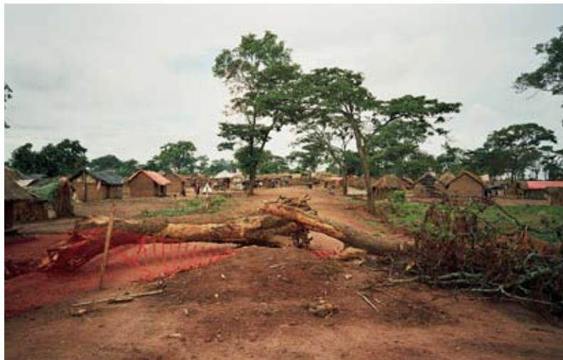
Next to the TFM plan zone, the entrance has been blocked to what is left of Mulumbu village.