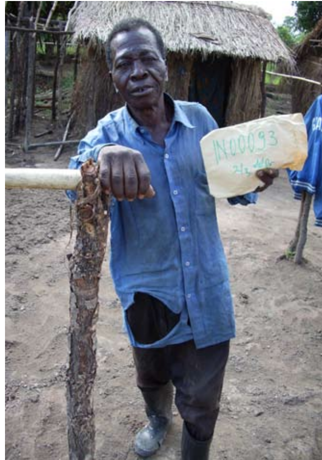
A man shows the resettlement contracts signed with Tenke Fungurume Mining.