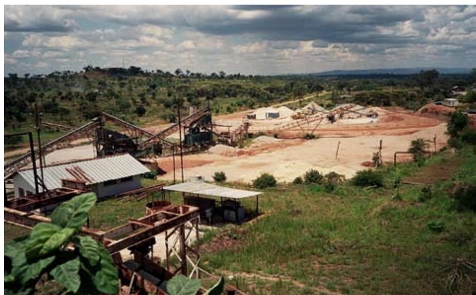
A stone crushing installation (front) stands idle, while TFM has ordered to build a brand new one (back).