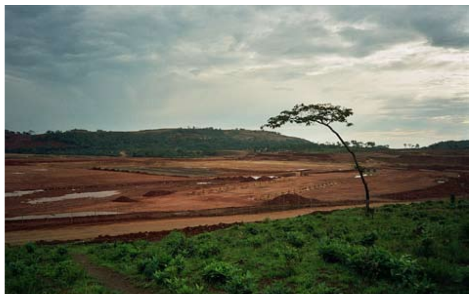
Tenke Fungurume Mining has levelled the zone where it plans to build the processing plant