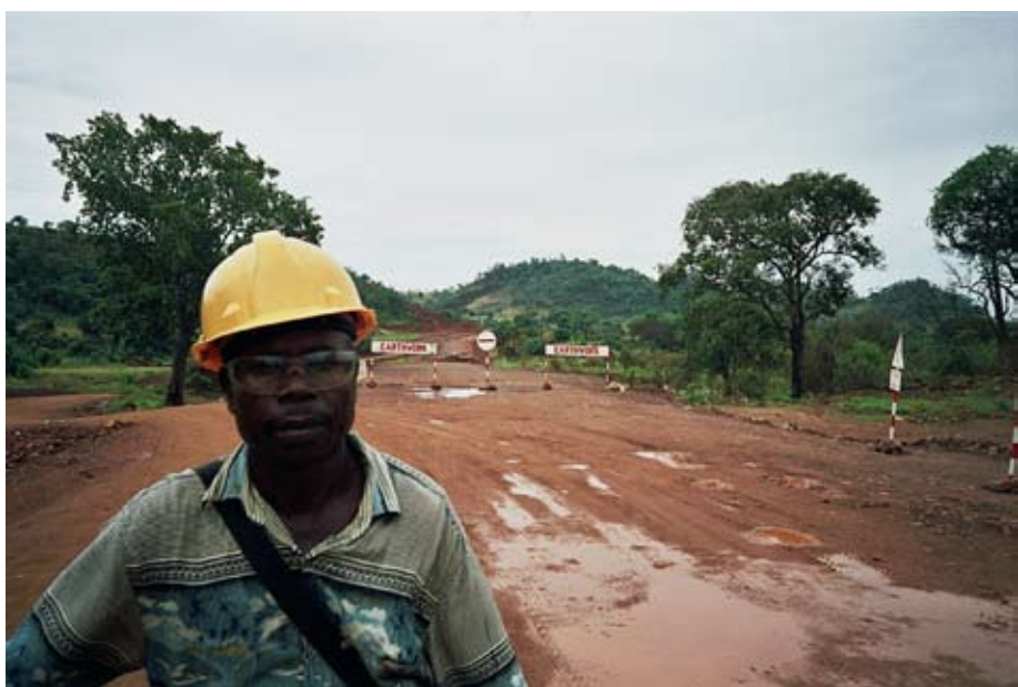
Within the TFMining concession, major road works continue.