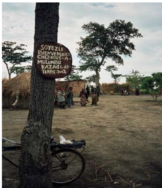
Mulumbu village, along with the neighbouring Amoni and Kaboko villages, have to disappear to make way for TFM's processing plant.

Three villages are located very close to the plant site: Mulumbu, Amoni and Kiboko. The total number of "the Project Affected People" is "1,660 individuals belonging to 391 households" 145 . Their inhabitants are mainly cultivators who work the surrounding fields.