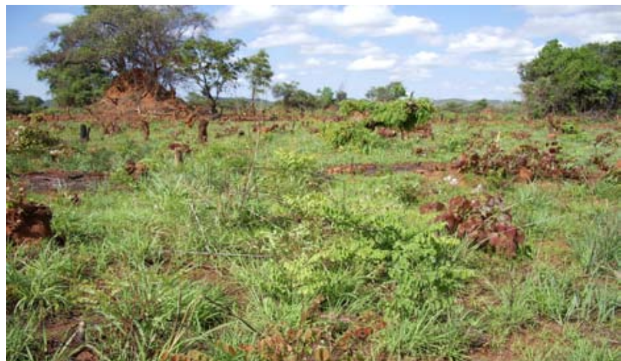
Tenke Fungurume Mining has given this plot of useless land, filled with tree trunks, to the resettled farmers from Mulumbu village.

Driving into the town of Fungurume, the first stop on the left is Schekilah’s restaurant, just meters away from the market. On the right, a road leads to the railway station and the Catholic Church of Saint-Jacques. At the far end of town, Fungurume’s Main Street goes north and leads to the airstrip of TFM and the Lukotola mission, some 20 km away.