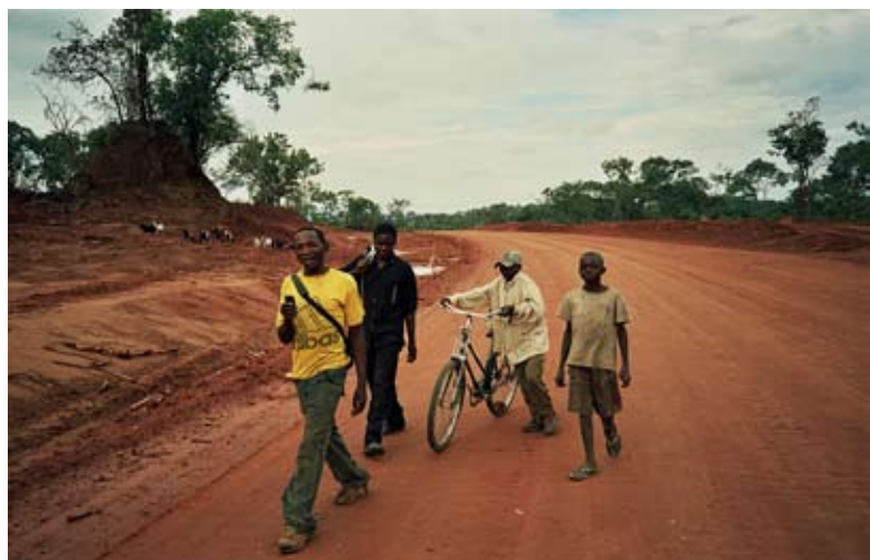
Tenke Fungurume Mining constructed extremely wide roads within its concessions.

Lundin never began mining. In February 1999, the company announced that the war made every mining activity impossible and it invoked 'Force Majeure'. Information also indicates that Tenke Mining Corp. lacked the money needed to proceed since financing from international banks disappeared when the war started. The reasons for halting the project have been questioned, but the Congolese state and Gécamines did not contest the Force Majeure that was lifted only in 2005. Because of the events, some of the DR Congo's richest mineral assets were untouched for almost ten more years.